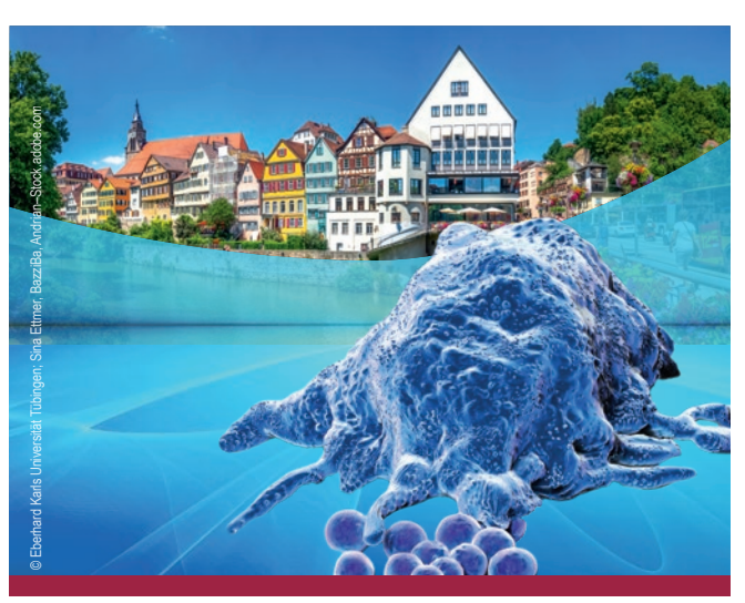
INSTITUTE OF IMMUNOLOGY, DEPT. OF INNATE IMMUNITY